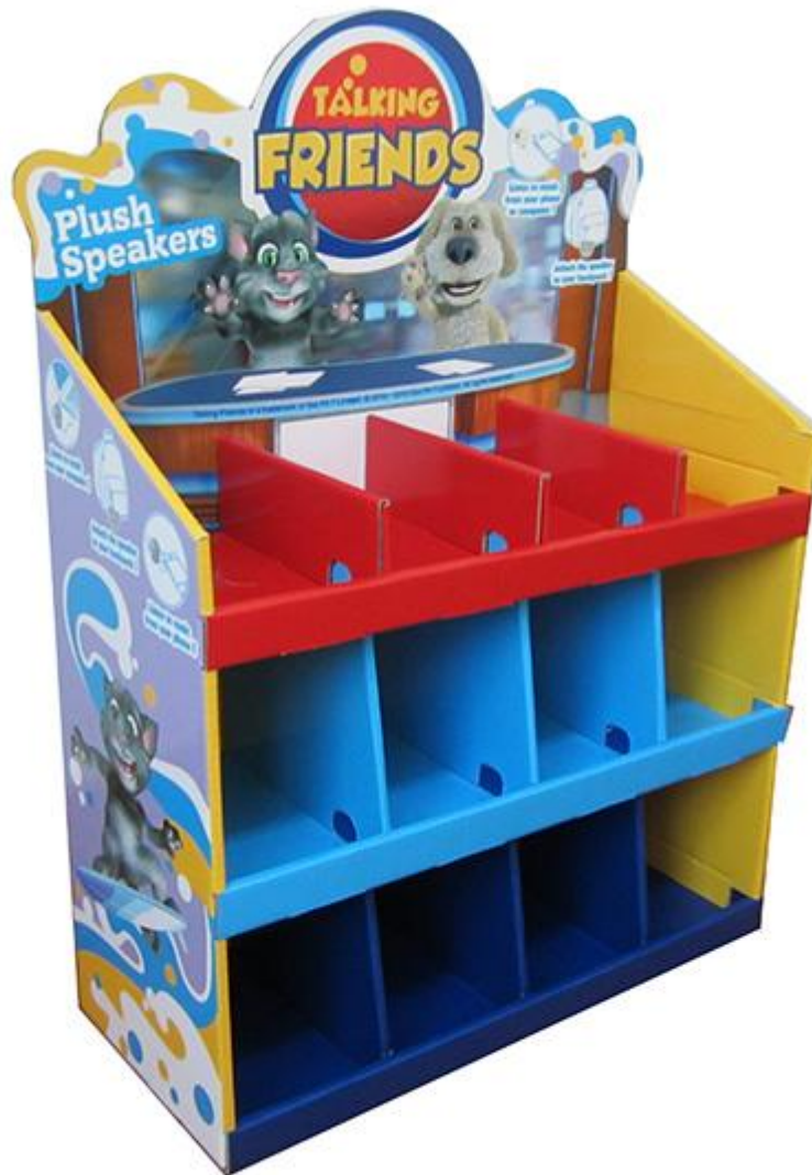
Sinst Corrugated 3 Layers Floor Tray Display for Toys Process